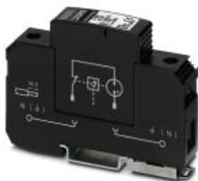
Surge arrester type 2, consisting of base element and protective plug with N-PE total current spark gap for mounting on NS 35/7.5, housing width: 17.5 mm (1 Div.)

Please be informed that the data shown in this PDF Document is generated from our Online Catalog. Please find the complete data in the user's documentation. Our General Terms of Use for Downloads are valid ( http://phoenixcontact.com/download )